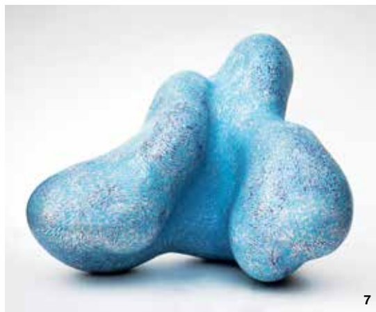
1 Johnson Tsang's Lucid Dream II , 27½ in. (70 cm) in length, porcelain, 2018. 2 Salvatore Arancio's A Soft Land No Longer Distant , varied dimensions, glazed and unglazed ceramic installation, 2017. 3 Eva Pelechová's V-21812911 , 3 ft. 11 in. (1.2 m) in length, Diturvit, slip cast. 4 Tsubasa Kato's Sankakunococoro , 31½ in. (80 cm) in height, porcelain, 2014. 5 Irina Razumovskaya's Ruin , 3 ft. 6 in. (1.2 m) in height, stoneware, porcelain, glaze, 2018. 6 Jiang Yanze's Mountains and Rivers , 5 ft. 3 in. (1.6 m) in length, abandoned ceramic honeycomb, 2018. 7 Sangwoo Kim's Summer , 26¼ in. (67 cm) in width, grog clay, colored porcelain, 2016. "Ceramics Now: 60th Faenza Prize-Special Edition," at International Museum of Ceramics in Faenza ( www.micfaenza.org ), Faenza, Italy, through October 7.